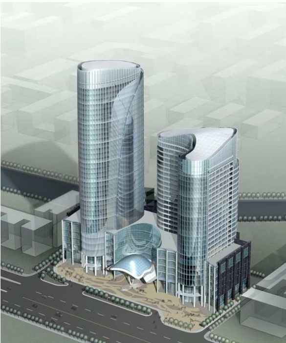
Exterior by day