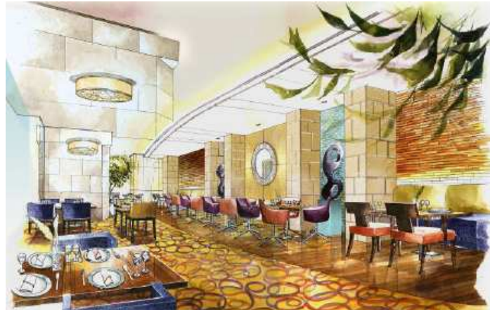
All-day dining restaurant