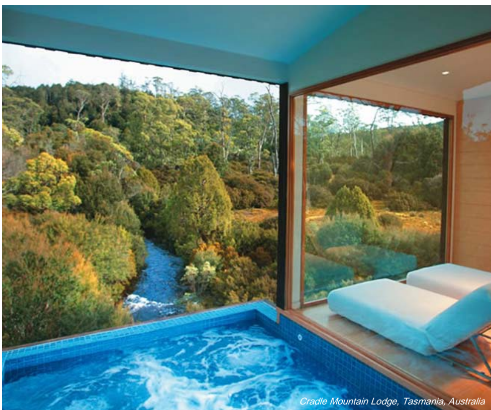
Cradle Mountain Lodge, Tasmania, Australia