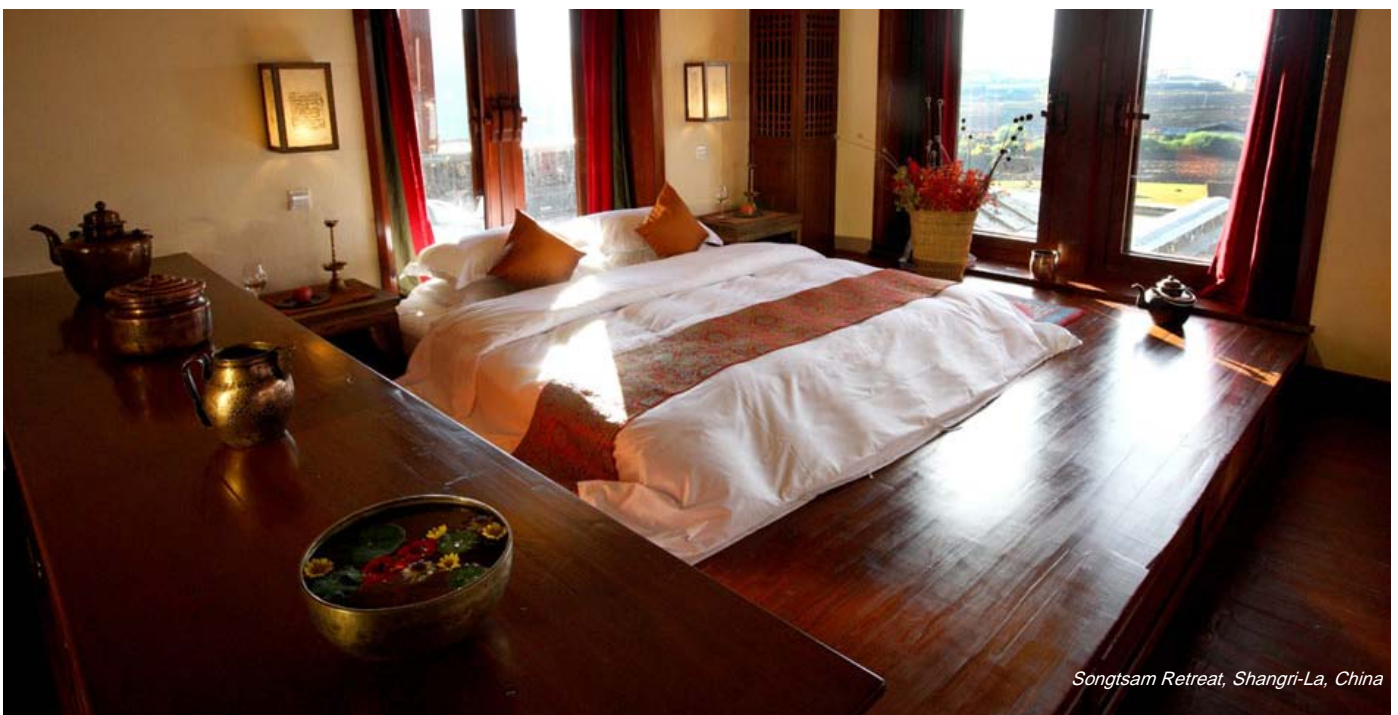
Songtsam Retreat, Shangri-La, China

At hotels in the MGallery collection the bathroom is naturally a place of sensorial experience devoted to personal care. Guests have the choice of a room with a shower or a large bathtub. Whichever they choose, and whether they are the type that can't face the day without an invigorating morning shower or a person who adores a leisurely, perfumed bath, the bathroom will certainly satisfy their expectations. And with the quality bathroom amenities provided for their use, guests are sure to enjoy a multi-sensory relaxing interlude after a day of sightseeing and excursions.