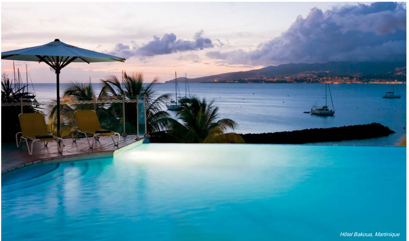
Hôtel Bakoua, Martinique

The MGallery collection intends to pursue international expansion in order to offer travellers avid for new experiences and discoveries an even wider choice of destinations. ►►