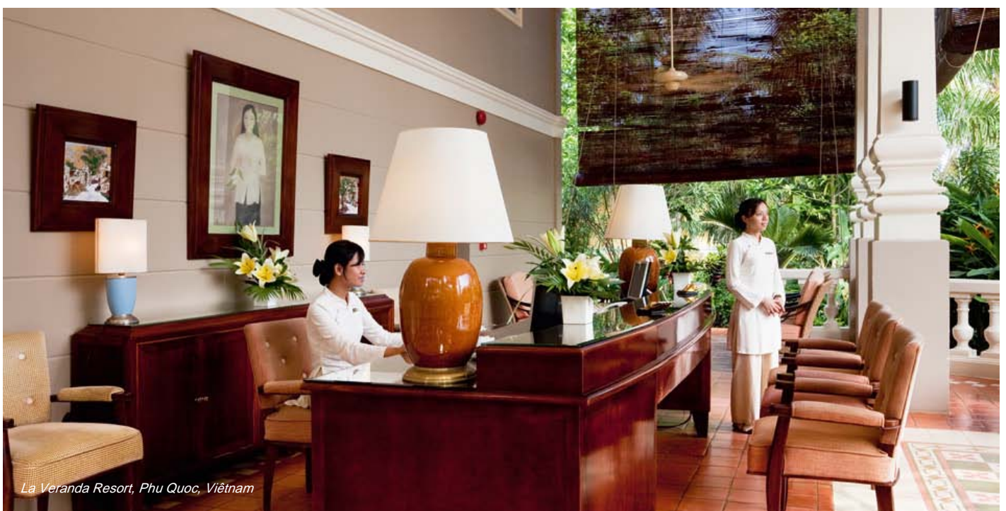
La Veranda Resort, Phu Quoc, Vietnam