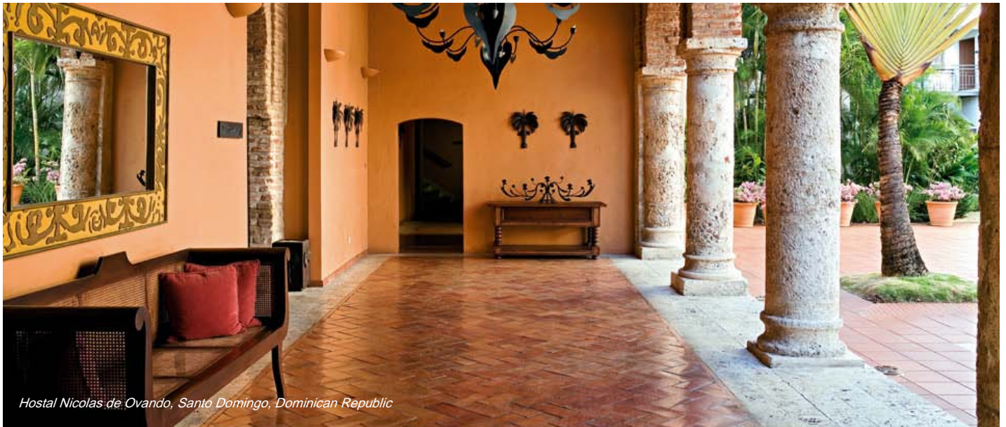
Hostal Nicolas de Ovando, Santo Domingo, Dominican Republic

Scarcely through the lobby door, the traveller begins to form a sense of the hotel and its story and experience the original. That is why everything, from the layout of different areas to the décor, ambient scents, visual identity, precious ornaments or unexpected objects, and the services on offer, are in keeping with the story and character of the individual property. This "spirit of the place" is a hallmark of hotels in the MGallery collection and is an important part of the overall guest experience.