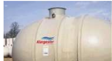
Underground storage tank